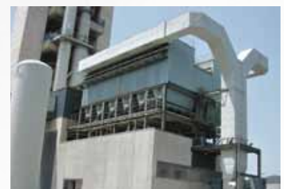
Filters in cement plant