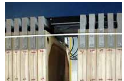
Filter Press detail