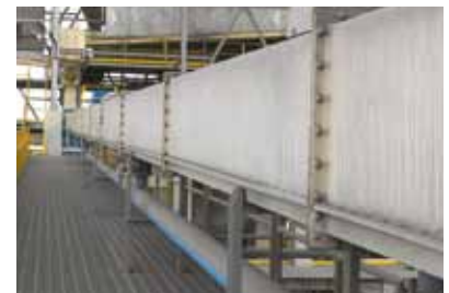
Air Slide Belt