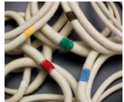
Felt Cords – Cocoa Press