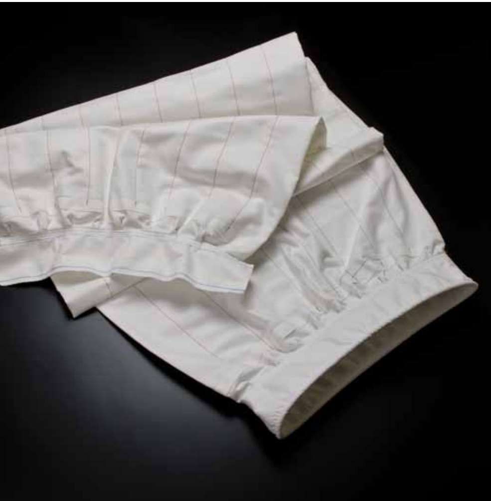
Multi-channel Bag (Aluminium Industry)