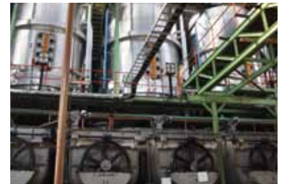
Drum Filters - Chemical Plant