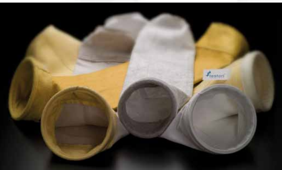
Bags - Different felt types

60 years' experience in chemical & pharmaceutical industries