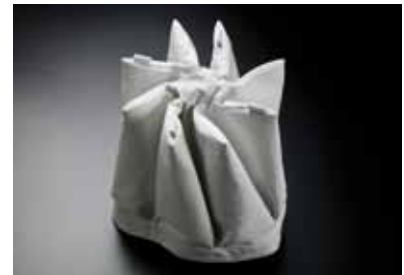
Star Bag (vacuum cleaners)