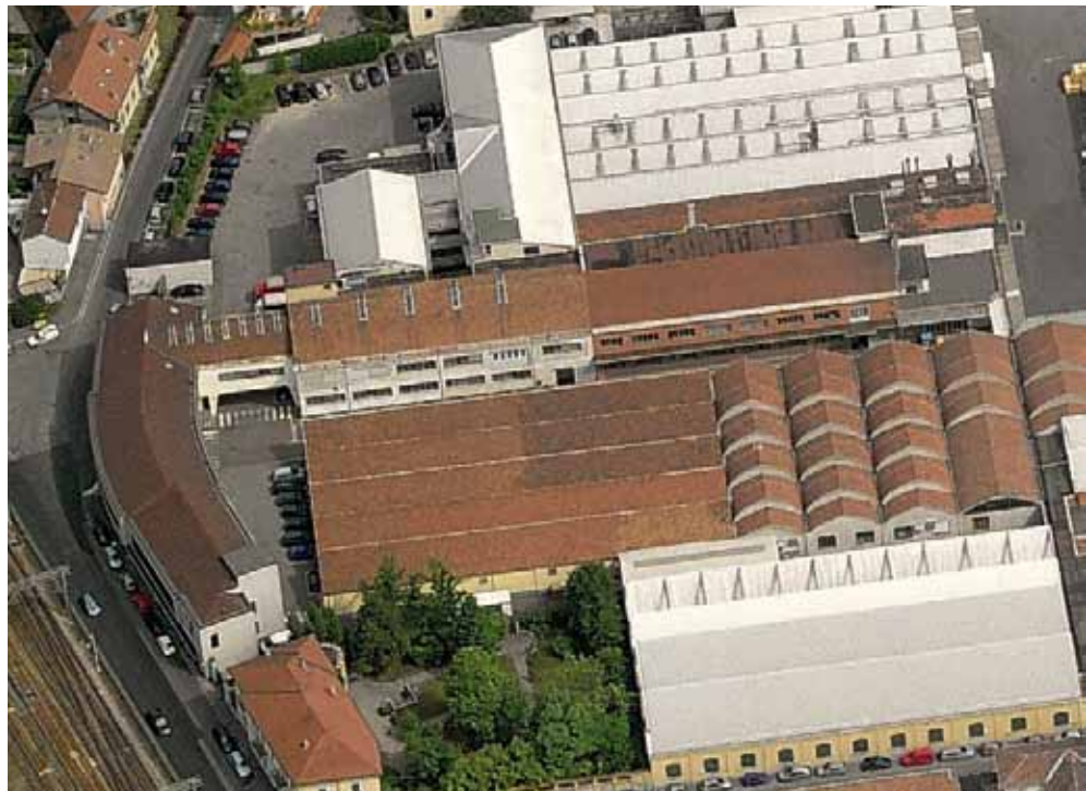
Testori Headquarters (Novate Milanese)