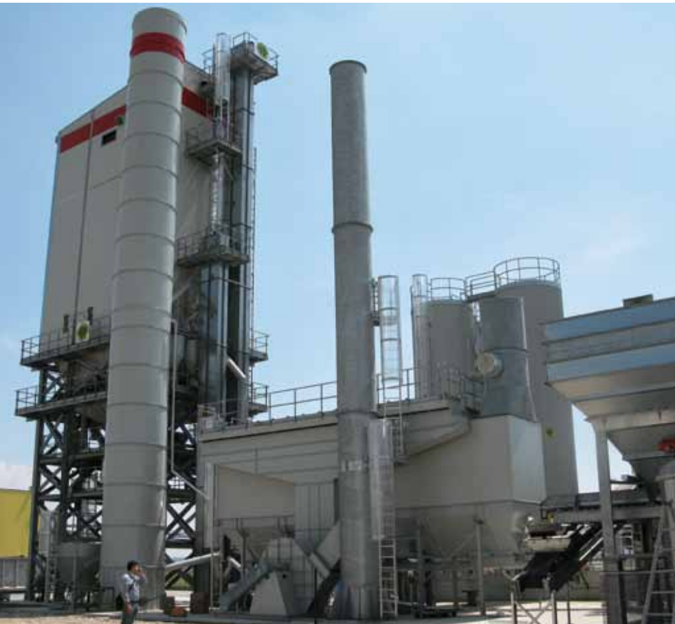
Asphalt Plant

Gas filtration adopts mainly felts (but also fabrics) while liquid filtration uses mainly fabrics (but also felts). Felts and fabrics are supplied both in rolls and hand made products.