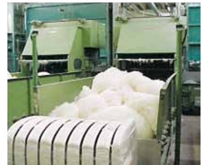
Felt Production: Staple