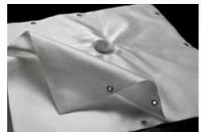
Filter Press Cloth