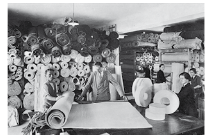
Old Testori manufacturing