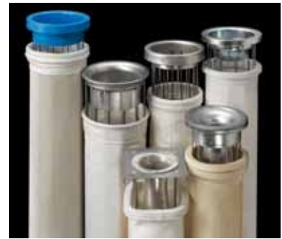
Cages and Bags