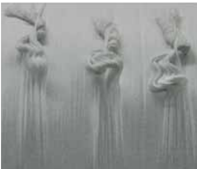
Warping - Beam