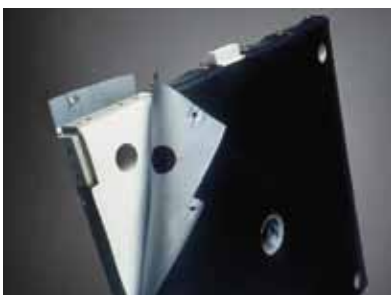
Filter Press Cloth