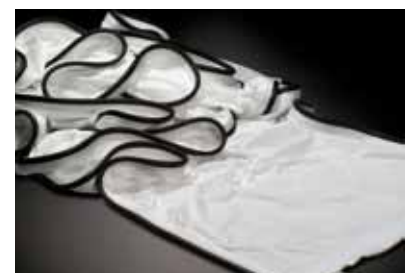
Belt Vacuum Filters